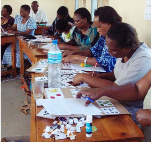
Pre-primary teachers making their own teaching aids