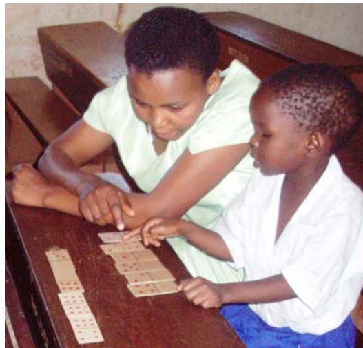
Teachers are now being helped to encourage pupils to think

We are determined to help Tanzania's primary schoolchildren and we see realistic, cost-effective, practical ways of doing so. We hope that supporters, old and new, will help us to help them.