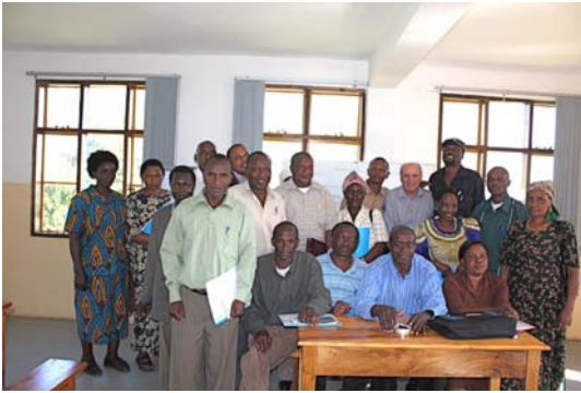
The headteachers attending the pre-primary seminar

schools whose pre-primary teachers had attended our previous training sessions.