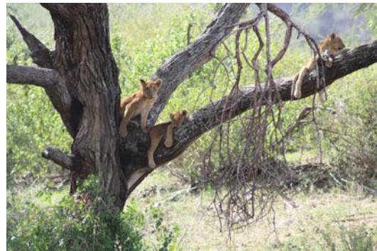
Tree-climbing lions delight the pupils

The volunteers pay a fee to join the teaching programme and this pays for two school outings each year. In August 2008, 25 standard IV pupils enjoyed four days on the coast at Pangani, and in March 2009 a group of 48 pupils from standard IV went to Lake Manyara National Park. For the first time the tree-climbing lions were witnessed and they saw three large cubs sitting comfortably in a nearby tree.