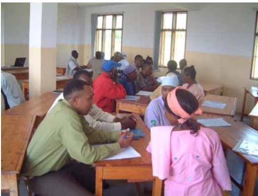
Discussions in the school committee training sessions

committees, and the relationship between the school committee and teachers, parents, the village government and the community. All the participants additionally considered the efficient preparation and running of meetings, the code of conduct among the committee officers and members and the role of the headteacher, and were taken through a detailed analysis of the school budget and their role in its preparation. This was very successful and each committee invited the two trainers to attend their next meeting in order to observe and offer further advice. Later discussions with these schools' headteachers revealed that this was some of the most important help. Support from the communities for their schools has been lacking, and now the school committee members have been informed of their crucial roles and motivated to attend to their duties.