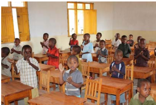
Kochakindo's new pre-primary school

Another busy and successful year, in which our Whole School Development Programme that is working with all parties to improve the quality of primary education, is having a direct impact on the country's education. Our computer centre and our vocational training school continue to serve the community, and plans for development are being implemented, as outlined below. Also our 32nd building project was completed to give Kochakindo primary school its own pre-primary building.