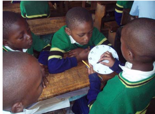
Effective group-work in a demonstration lesson