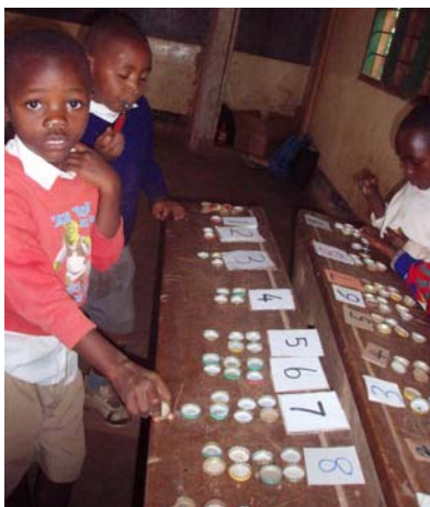
Pupils show their understanding of counting