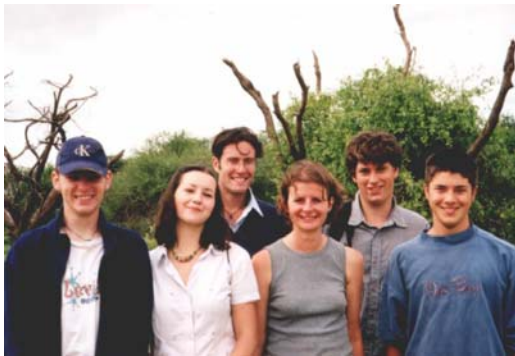
The student teachers this year in Lake Manyara Park

In 1998 the charity started its own 'gap year' programme for native English speakers to help to teach English to the primary school pupils. These student-teachers have an intensive two week training course in England before they fly out to Tanzania in January, and they stay for eight months or more.