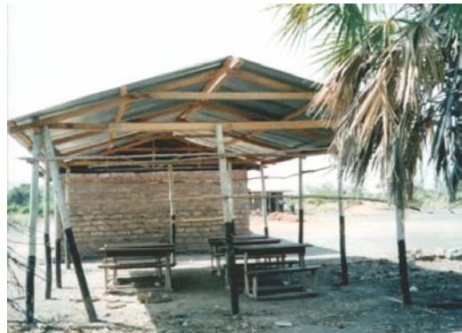
Kochakindo's new shelter is an improvement at least

The community in Kochakindo is ecstatic about the new classroom and shelter, and throughout the work the school committee and members of the village government were exceptionally co-operative. The charity too is delighted that its work has reached out to the lowland areas. If our general funds are sufficient we may consider further work to help Kochakindo.