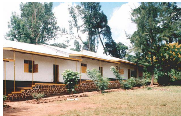
New classrooms at Palangeny